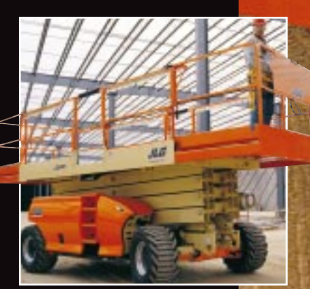
Wide Platforms Get You Closer to Your Work Area