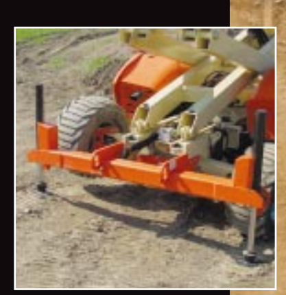
Optimal One-Touch Levelling Jacks For Faster Set Up