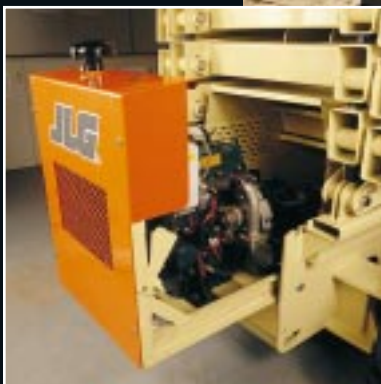
Roll-Out Engine Tray for Serviceability