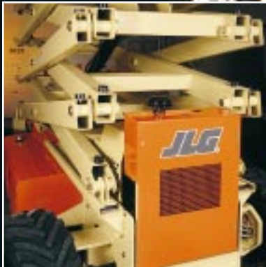
Strengthened Arm Stack for Improved Stack Rigidity