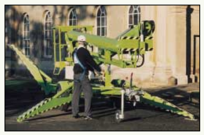
Fully proportional hydraulic outriggers make setting up and levelling quick and easy even on gradients.