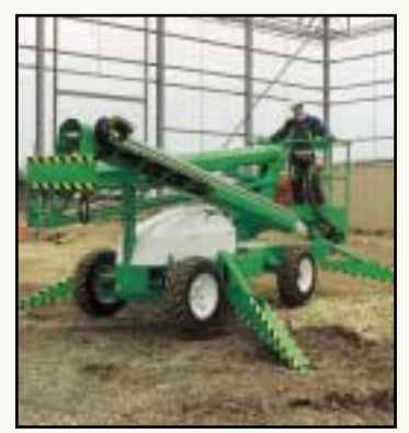
Also available on a selfdriveable 2x4 or 4x4 base the Nifty 170SD.