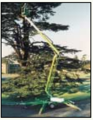
The Nifty 170's outstanding reach makes it ideal for a wide range of applications.