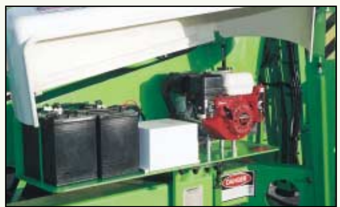
Petrol / Battery Bi-Energy power option, mounted for easy maintenance access. This system allows discreet and fume free operation or continual use even where an external power source is not available.