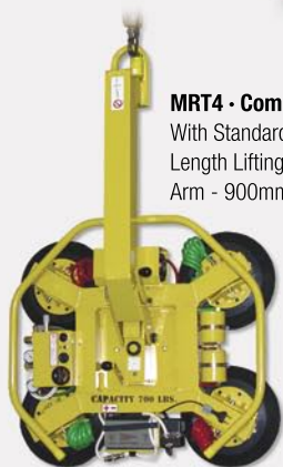
MRT4 - Compact With Standard Length Lifting Arm - 900mm

Dual Circuit MRT4 - Code VGL17 Dual Circuit MRT4 variable length lifting arm - Code VGL18