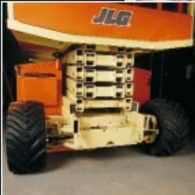
Wider Arm Stack for Improved Stability