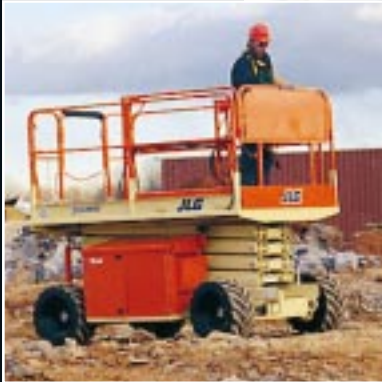
Standard Four-Wheel Drive for Terrainability