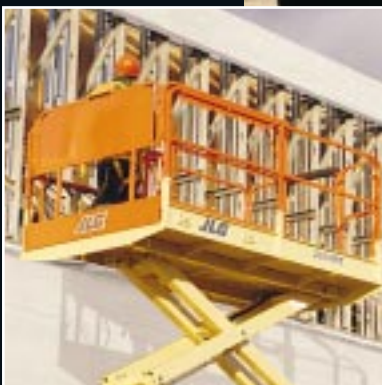
Large, High Capacity Work Platform